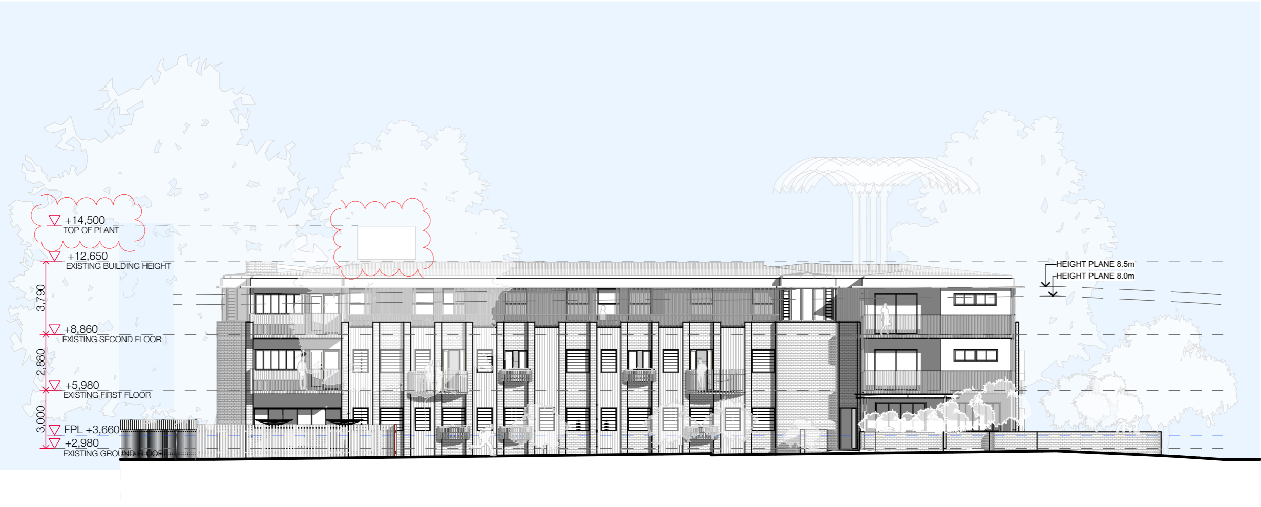
WEST ELEVATION 1:200

NOTE Figured dimensions take precedence over scaled drawings. Contractors to check and verify all levels datum and dimensions on site. All materials and workmanship to be in accordance with current written manufacturers instructions local regulations and SAA codes. Conflicting information to be brought to notice of the architect and clarification sought before proceeding with any works. All drawings are not for construction and are subject to further design development, consultant input, council and legislative requirements. Refer to General notes page for legend and abbreviations